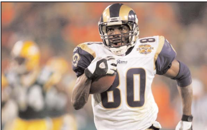
WR Isaac Bruce's 902 career receptions rank seventh on the NFL's all-time receptions list.