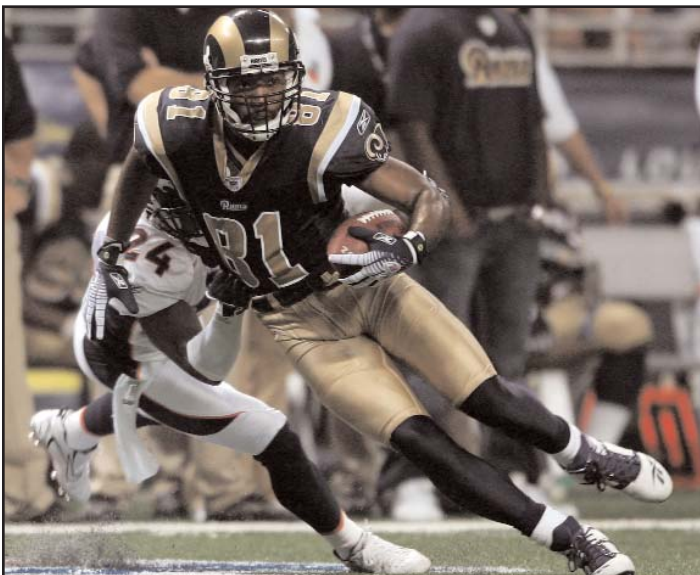
With seven receptions WR Torry Holt (744) can move past Michael Irvin and Charlie Joiner (tied for 21st) on the NFL's all-time career receptions list.